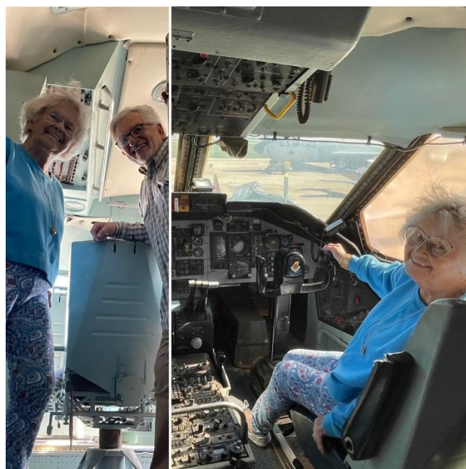
The docents and club members helped her do so!