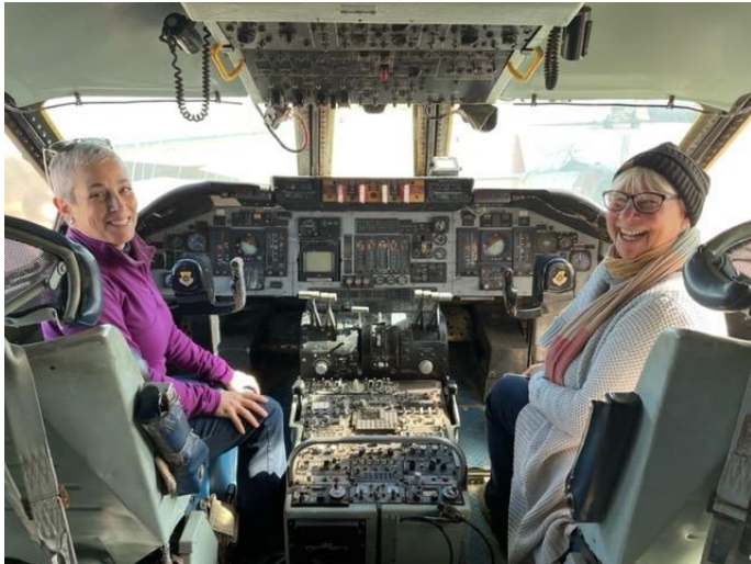
The Wheelers enjoyed climbing into the cockpit!